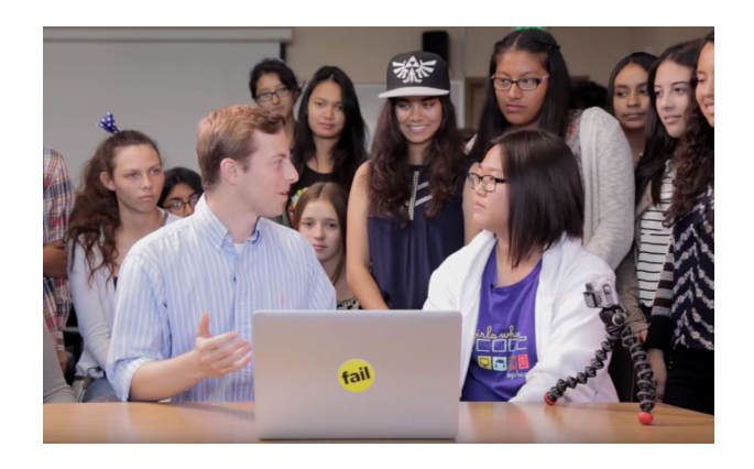
"The Try Guys Try Coding With Girls Who Code"